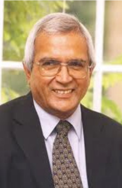
THE RT HON. THE LORD DHOLAKIA OBE DL

Educated in India and Tanzania, Lord Dholakia came to Britain to study at Brighton Technical College. His first job as a Medical Laboratory Technician at Southlands Hospital in Shoreham-by-Sea.