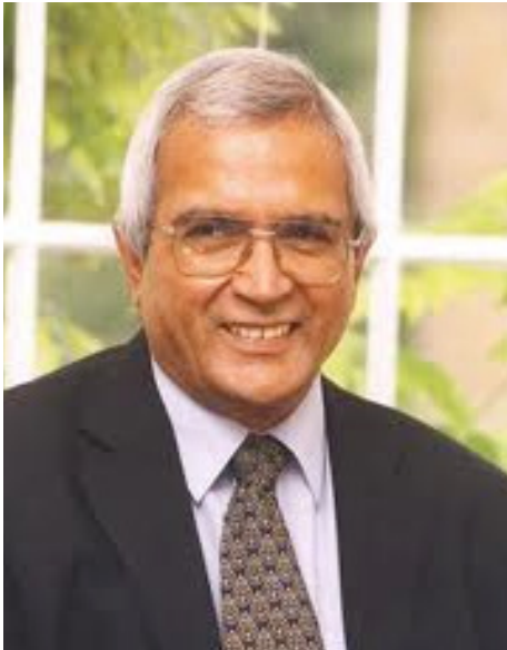
THE LORD DHOLAKIA OBE DL

Educated in India and Tanzania, Lord Dholakia came to Britain to study at Brighton Technical College. His first job was as a Medical Laboratory Technician at Southlands Hospital in Shoreham-by-Sea.