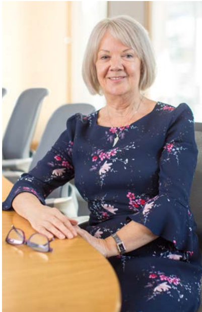
DAME MARY PERKINS

“Welcome to the ninth British Citizen Awards, which is growing from strength to strength with every ceremony. The title is so very apt as it recognises those who demonstrate true citizenship by working tirelessly to make a positive impact in their community, without thinking of themselves.