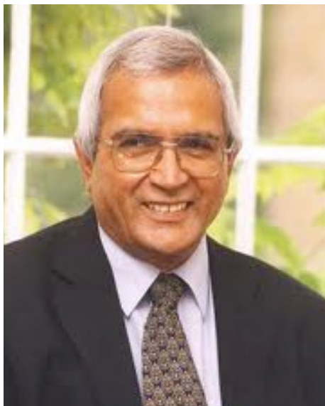
THE LORD DHOLAKIA

Educated in India and Tanzania, Lord Dholakia came to Britain to study at Brighton Technical College. His first job as a Medical Laboratory Technician at Southlands Hospital in Shoreham-by-Sea.